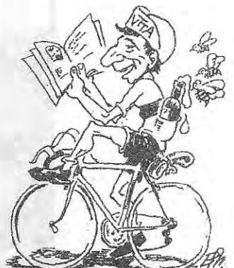
"And there might even be a copy of the 'Beano' at the next feeding station"