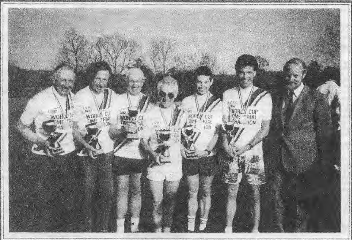
World Cup Time Trial Veteran Champions.