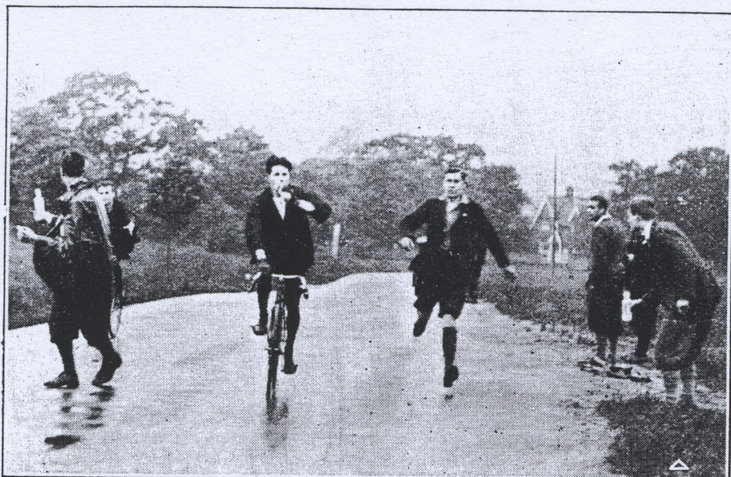
Drinks were welcome on a wet and windy morning.

"HERE come's the Hastings locomotive," said someone in the small crowd at the finish of the Catford "50."