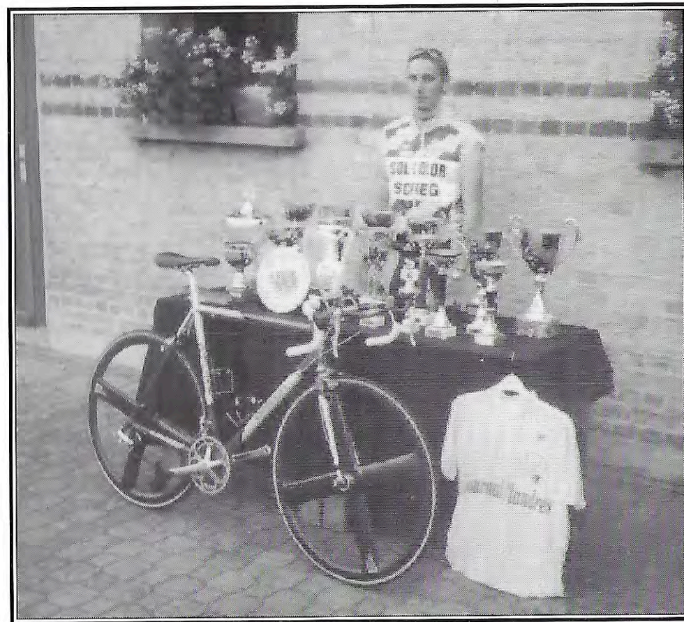
Awards won during 1996 with French club O.G.S.

August 10th ~ 16th 1997 Easton College, Norwich.