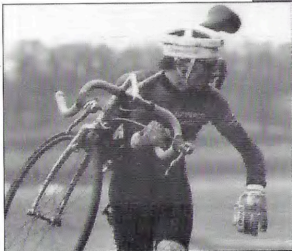
Cyclo-Cross International Meeting 1992