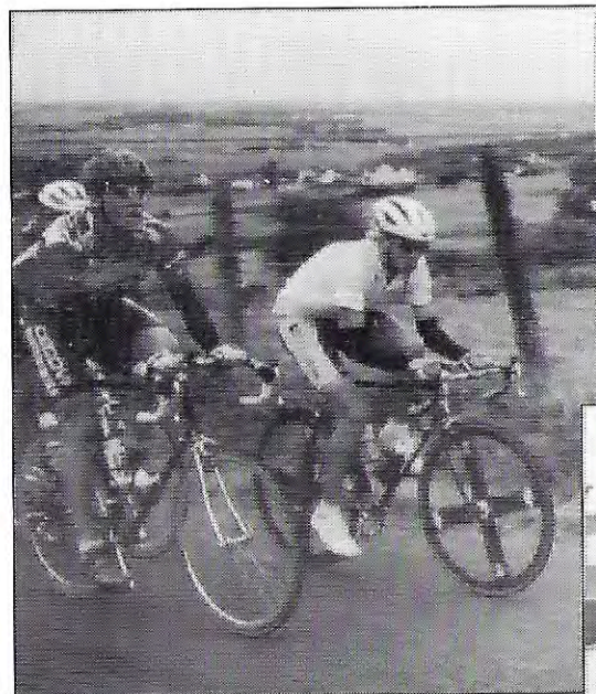
The Yellow Jersey Leading the break in 3-day Rue-de-la Montagne