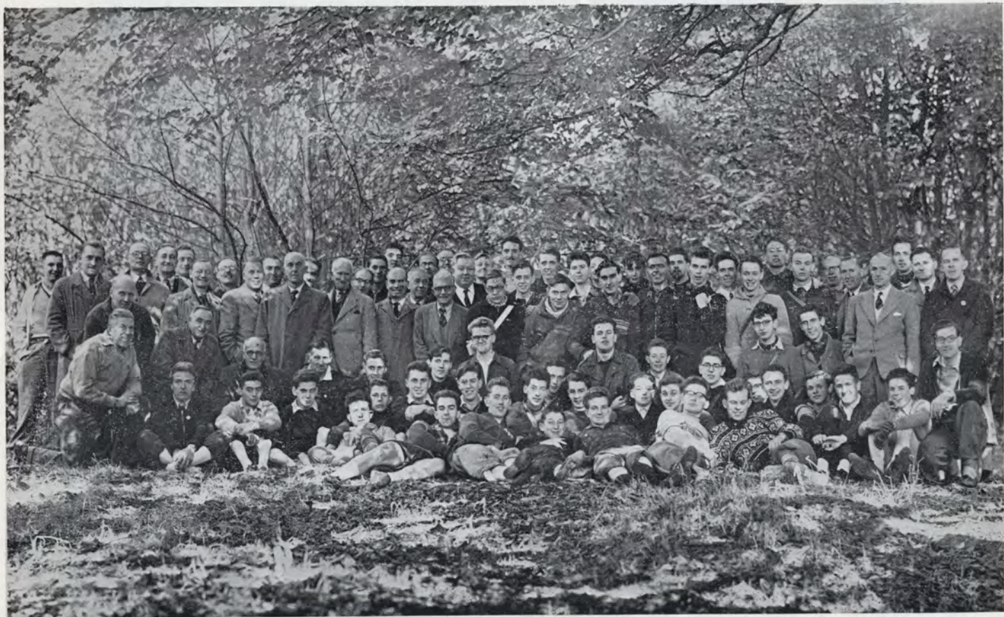
THE CATFORD CYCLING CLUB, YORKS HILL, 1955